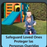
Safeguard Loved Ones Proteger las Personas Queridas