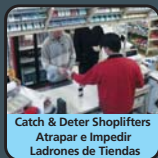
Catch & Deter Shoplifters Atrapar e Impedir Ladrones de Tiendas

At last wireless security for today's world!