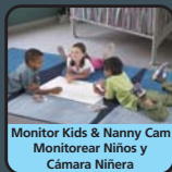
Monitor Kids & Nanny Cam Monitorear Niños y Cámara Niñera