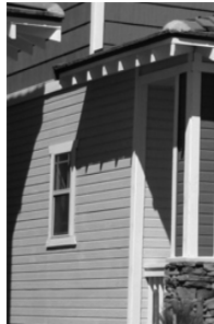
8. Under eaves

To see a complete range of security solutions, please visit www.swannsecurity.com