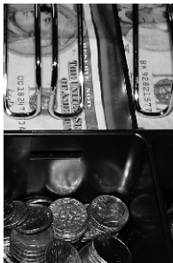
6. Cash register