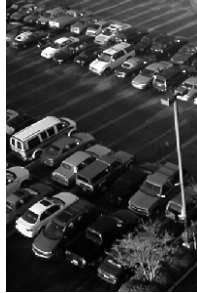
3. Car Parks