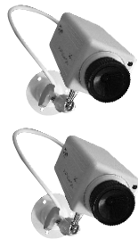
7. Mix dummies & real cameras