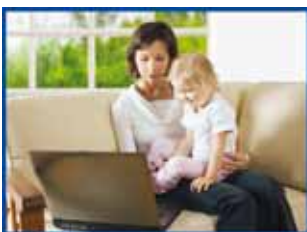
See & hear loved ones