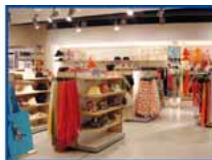
Protect your property