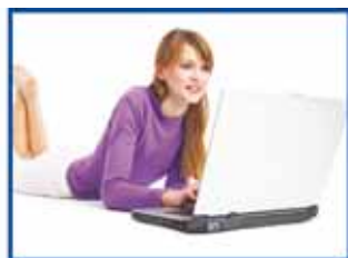
Stay in touch on the road